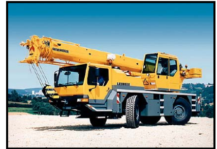
Figure 6.3 LTM 1030-2.1 Mobile Crane