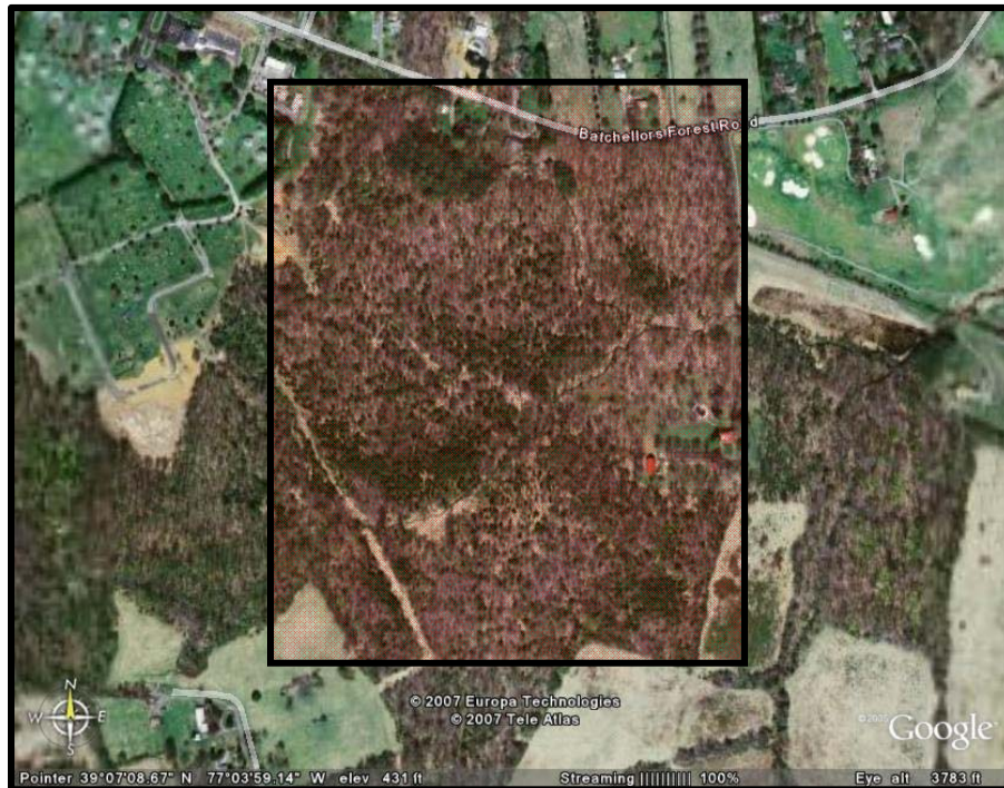
Figure 6.2 Google Earth image of WCA site in Olney, MD

The Google Earth aerial photograph above shows the vast 60 acre site roughly highlighted in the red box. Only a portion of this site will be developed for the WCA Flagship Building and Gymnasium construction. The rest of the site will be developed over the next decade and will eventually become an entire WCA campus. A full 60 acre site plan can be seen in Appendix A (S.1), with the site perimeter and preserved forests shown. The second site plan (S.2) shows the planning and layout for the superstructure phase of the project.